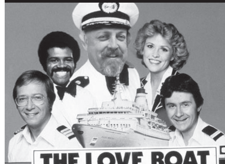
Oh yeah, love boat