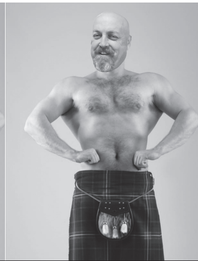
Haggis and kilts + golfing